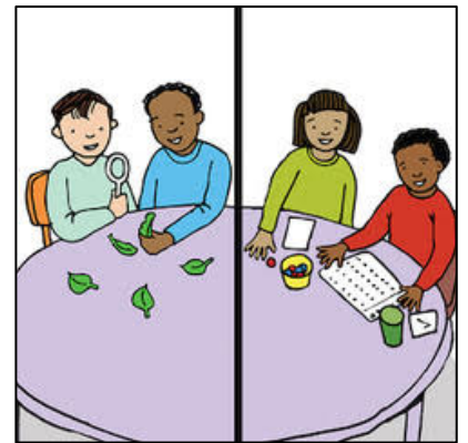
Math & Science