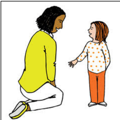
Planning for Play

Print and cut these icons to create a daily schedule. Keep your plan for each day simple. You can always add more activities if there is time and interest, but it feels good to complete a plan!